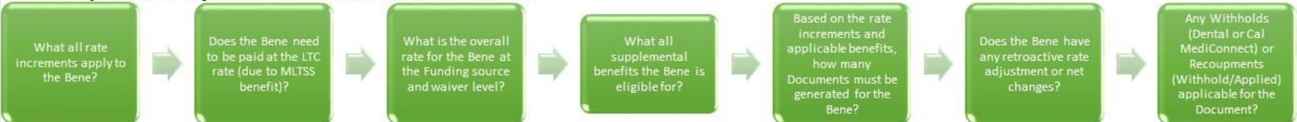
Figure 2. CapMan also verifies that the payment instructions, fund source instructions, actual amounts paid by the State controller, and amounts requested from the federal government for reimbursement are reconciled. Approximately $35 BILLION was processed in 2014.