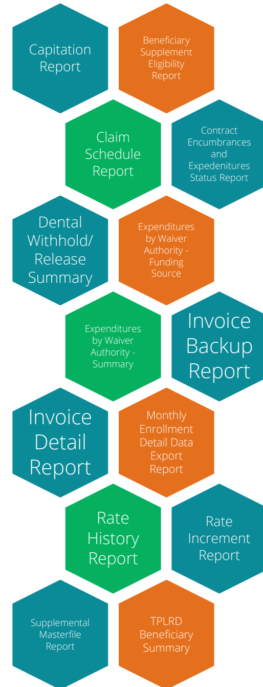
Figure 5. Reports are based on User Group and/or User Role ensuring that Personal Health Information (PHI) is accessible only to the authorized relevant parties. Commonly used reports examples include, Invoice Backup Report, Beneficiary Detail Report, or Disbursement Register Report.