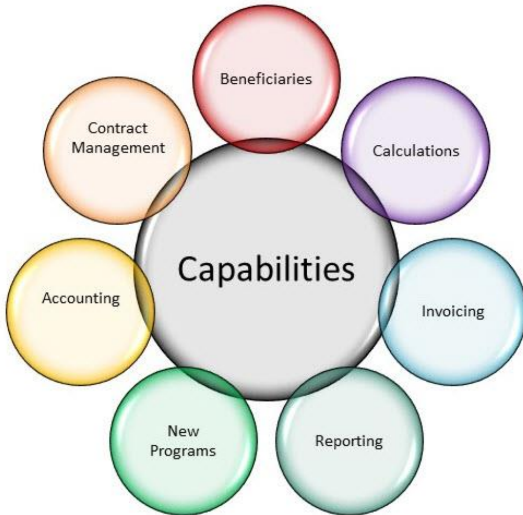
Figure 1. CapMan's model allows for the seamless integration and incorporation of multiple entities across multiple departments in order to orchestrate and automate accurate payments each month for roughly 12 million beneficiaries in a timely and efficient manner. From Beneficiary Management, Contract Management, Complex High-level calculations, and Reporting, CapMan's system is a multi-directional portal that transports and processes data cross-sectionally while proffering multi-functionality.